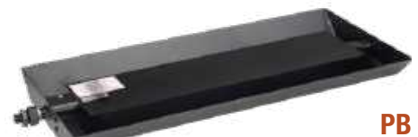
PB Flame Pan Burners (Sizes: 16", 18", 20", 24", 30", 36", 42")

*These burners are shown with optional control system.