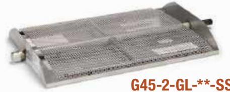
G45-2-GL-**-SS Stainless Steel See-Thru Triple T Glass Burners (Sizes: 16/19", 18/20", 24", 30", 36", 42", 48", 60")