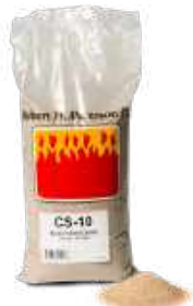
CS-10 Select White Sand (10 lb. bag)