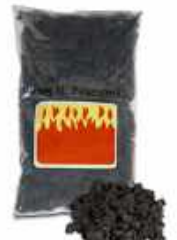
EB-1 Black Embers