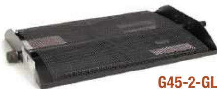
G45-2-GL See-Thru Triple T Glass Burners (Sizes: 16/19", 18/20", 24", 30", 36", 42", 48", 60")