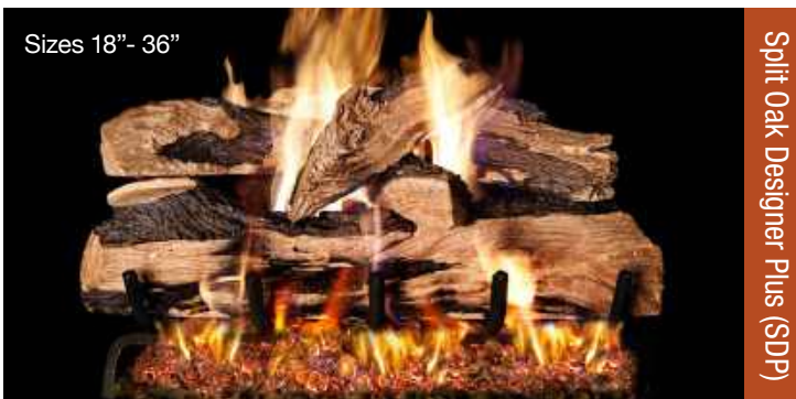
Split Oak Designer Plus (SDP)