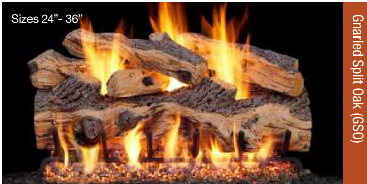
Charled Split Oak (GSO)

Pictured above: Mammoth Pine (MP) gas logs with Epic (EC) burner system.