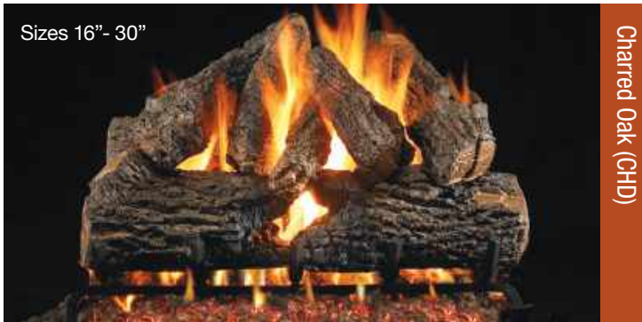
Charred Oak (CHD)

Pictured above: Charred Majestic (CHMJ) gas logs with G45 burner system.