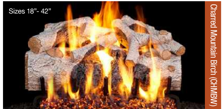
Charred Mountain Birch (CHMBW)