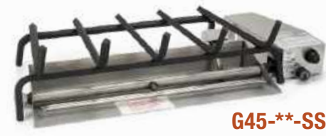
G45-**-SS Stainless Steel Triple T Burners* (Sizes: 16/19", 18/20", 24", 30", 36", 42", 48", 60")