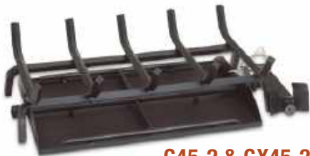
G45-2 & GX45-2 See-Thru Triple T Burners* (Sizes: 16/19", 18/20", 24", 30", 36", 42", 48", 60")