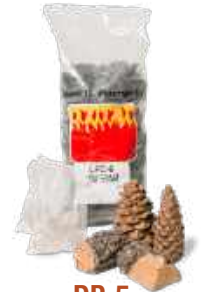
DP-5 Decor Pack