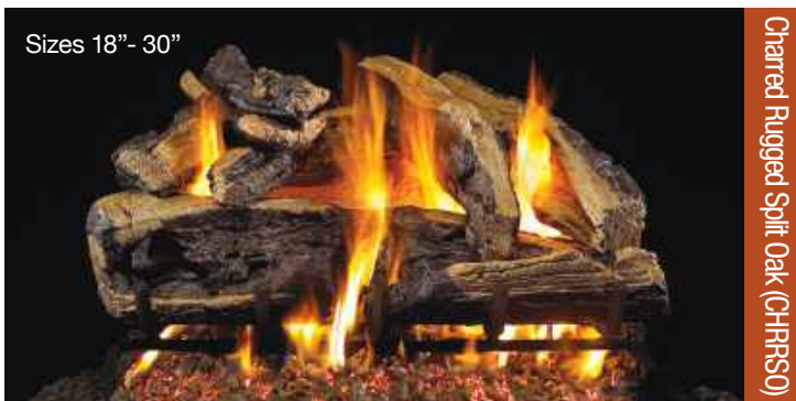
Charred Rugged Split Oak (CHRSSO)