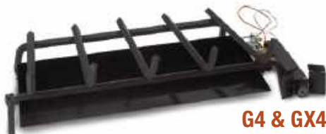
G4 & GX4 Glowing Ember Burners* (Sizes: 12", 16/19", 18/20", 24", 30", 36", 42", 48", 60")

Scan to see the full list of vented burners.