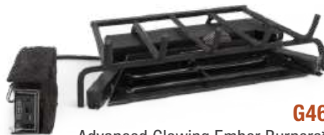
G46 Advanced Glowing Ember Burners* (Sizes: 18/20", 24", 30")