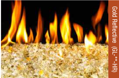
Gold Reflective (GL-**-HR)