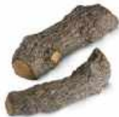
SD-BONUS Designer Bonus Logs