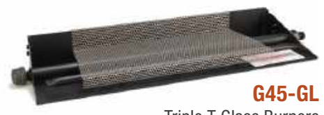
G45-GL Triple T Glass Burners Sizes: 16/19", 18/20", 24", 30", 36", 42", 48", 60"