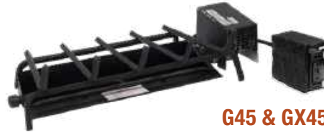
G45 & GX45 Triple T Burners* (Sizes: 16/19", 18/20", 24", 30", 36", 42", 48", 60")