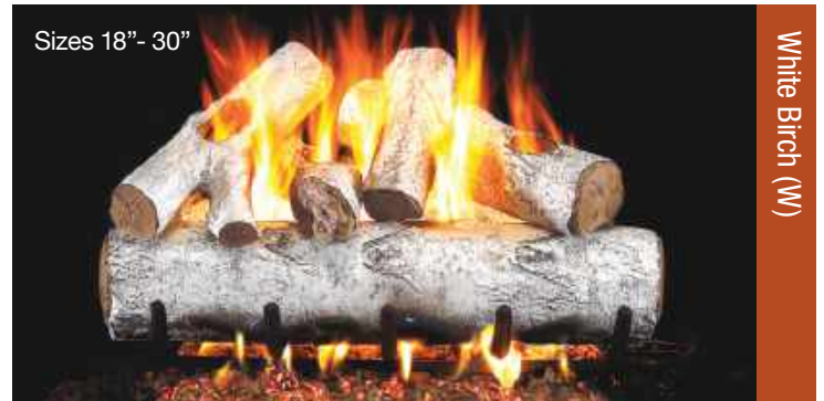
White Birch (W)