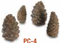
PC-4 Designer Pine Cones

Scan to see the full collection of premium accessories.