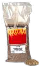
LF-15 Vermiculite Granules