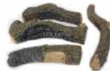
BDC-4 Charred Branches