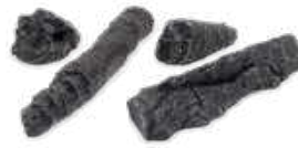
CHA-1 Charred Accessory Kit