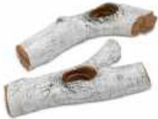
SB-BONUS Birch Bonus Logs