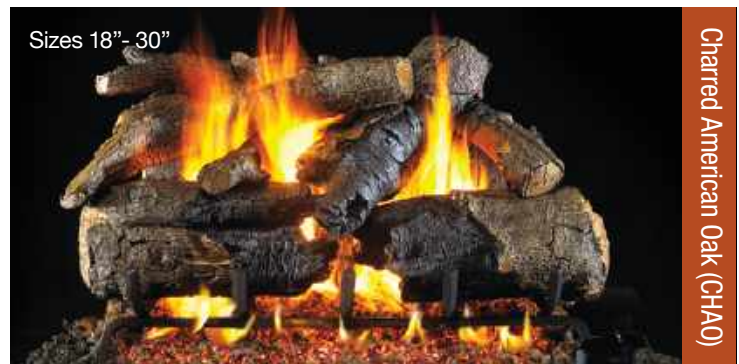
Charred American Oak (CHAO)