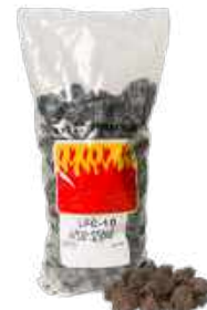
LFC-10 Lava-Fyre Coals (10 lb. bag)