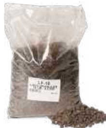
Lava-Fyre Granules • LF-10 - 10 lb. bag • LF-5 - 5 lb. bag