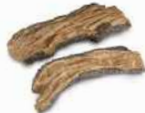
SS-BONUS Split Bonus Logs