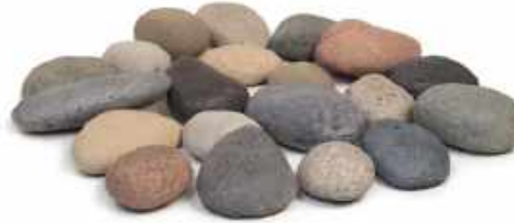
20-pc. River Rock Fyre Stones