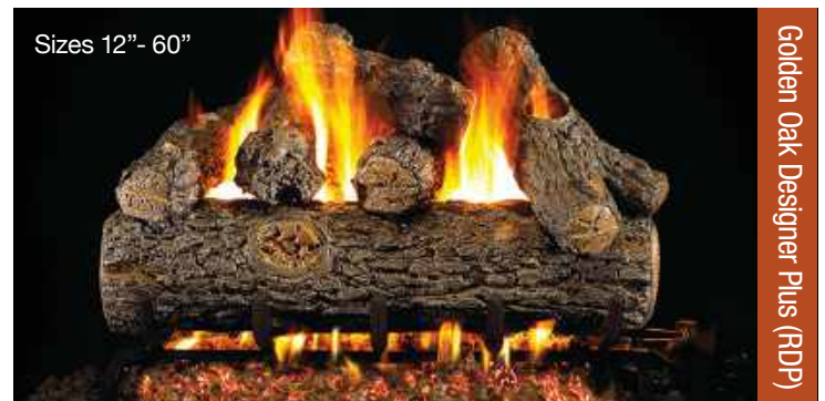
Golden Oak Designer Plus (RDP)