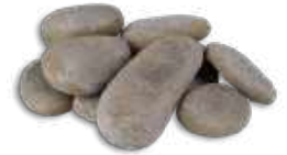
10-pc. River Rock Fyre Stones (4 Colors available)