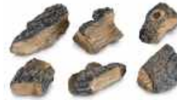
Wood Chips: • WCH-6 - Charred • WC-6 - Designer